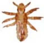
Nymph form

Nymph: The nit hatches into a baby louse called a nymph. It looks like an adult head louse, but is smaller. Nymphs mature into adults about 7 days after hatching. To live, the nymph must feed on blood.