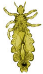
Adult louse

Adult: The adult louse is about the size of a sesame seed, has six legs, and is tan to greyish-white. In persons with dark hair, the adult louse will look darker. Females, which are usually larger than the males, lay eggs. Adult lice can live up to 30 days on a person's head. To live, adult lice need to feed on blood. If the louse falls off a person, it dies within 2 days.